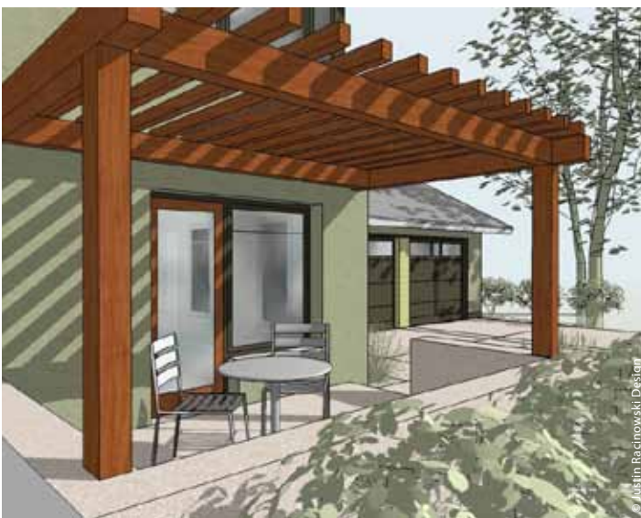
COURTYARD PATIO AND TRELLIS